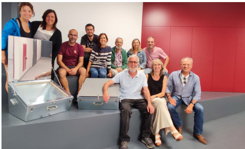
Figure 3: Balenyà Sostenible team handing over solar ovens to Bantandicori Association as part of the Tabassaye Project.

elementary school rooftops and it's currently designing a project to develop a maternity shelter to be implemented in Senegal. These projects showcase the potential of energy communities to expand it's social impact beyond their region.