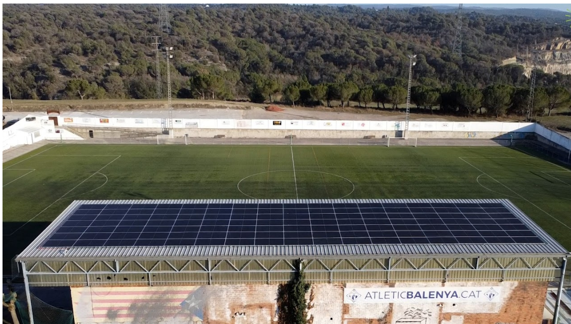
Figure 2: Football field in Balenyà with photovoltaic installations from the Energy Community

The energy produced in these specific installations is then distributed to different households around Balenyà thanks to coefficient estimates that allow distributors to estimate the proportional price reduction for each family. For the optimisation of the coefficient, the cooperative signed a collaboration agreement with Urban ImpactE , to optimise the distribution coefficients, with the calculation of the economic impact of each of the possible modifications, in order to have a cost-benefit balance.