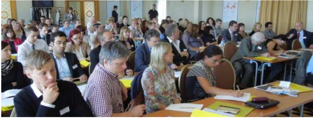
Figure 7. NORBA's final conference