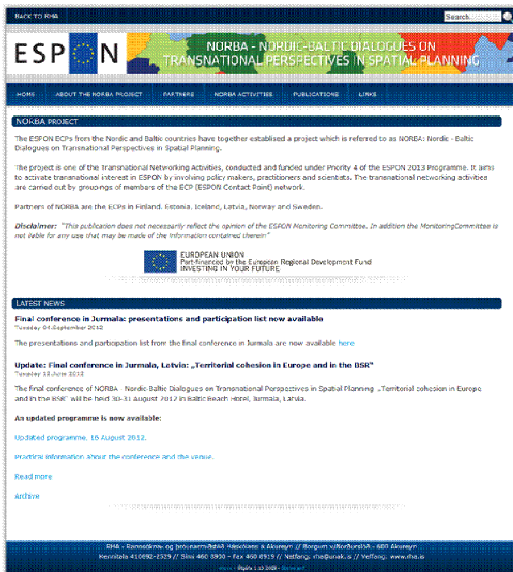
Figure 2. The main page of the NORBA website (www.norba.is/norba)

The number of visits to the NORBA website from its establishment until the 1st of September 2012 was 766. The number of visits to the NIBR website, where material from the NORBA conference is located has been 79 up until now. This means that the NORBA website and websites related to NORBA events have had so far 845 views.