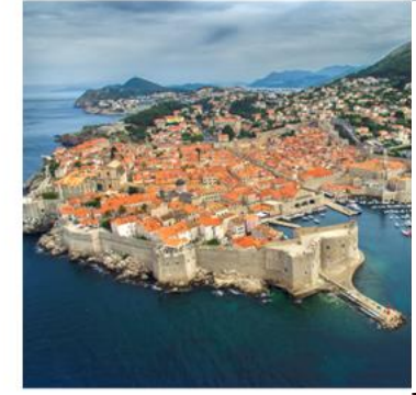
Présidence croate du Conseil de l'Union européenne