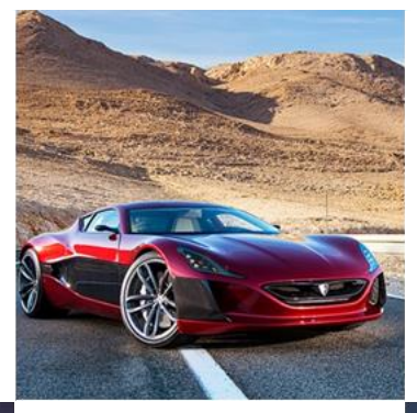
welcoming you to Croatia!