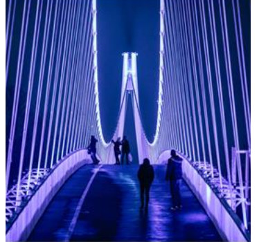
Kroatische Vorsitz im Rat der Europäischen Union