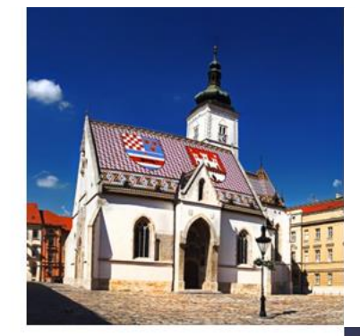
Looking forward to...