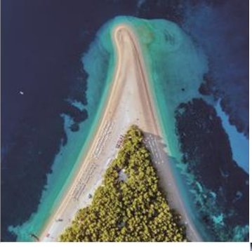
Croatian Presidency of the Council of the European Union