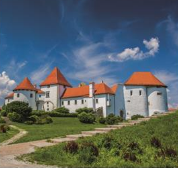
Hrvatsko predsjedanje Vijećem Europske unije